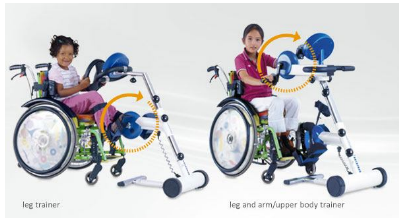
Figure 1. Picture of MOTomed Gracile12 model, showing the movement of the machine